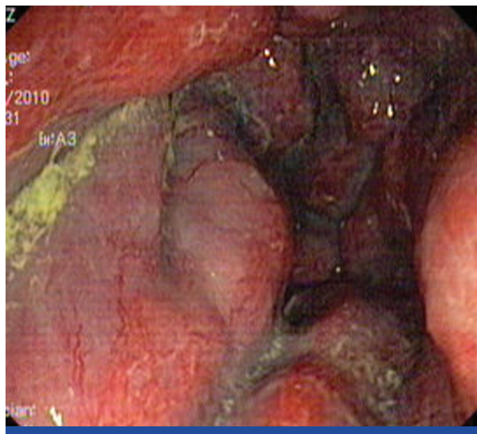
[Table/Fig-6]: Colonoscopy showing Hyperemia & bluish nodular folds in rectum suggestive of ?Angiomatosis.