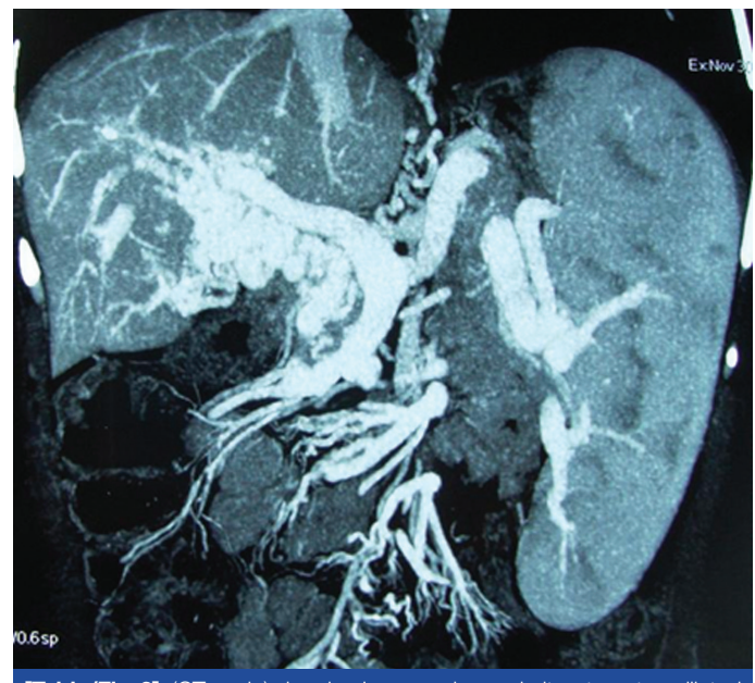
[Table/Fig-2]: (CT angio) showing Increased vascularity at porta; dilated splenic vein; increased vascularity at lower end of oesophagus.