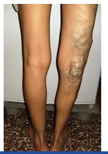
[Table/Fig-1]: Varicosities & soft tissue hypertrophy on posterior aspect of leg.