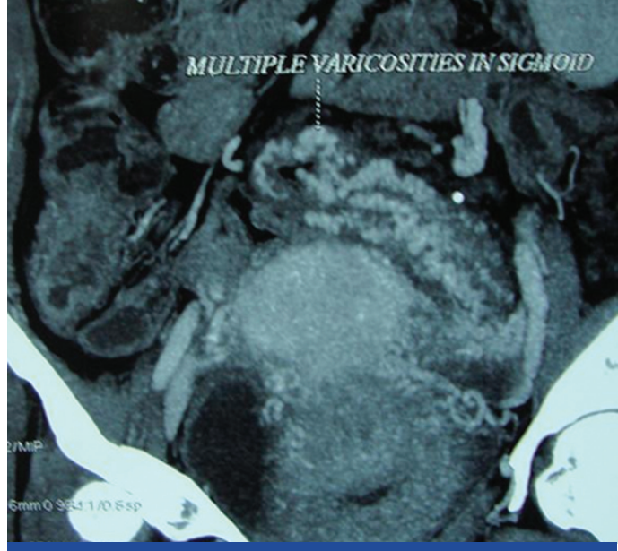
[Table/Fig-4]: CECT abdomen showing multiple varicosities in sigmoid colon.