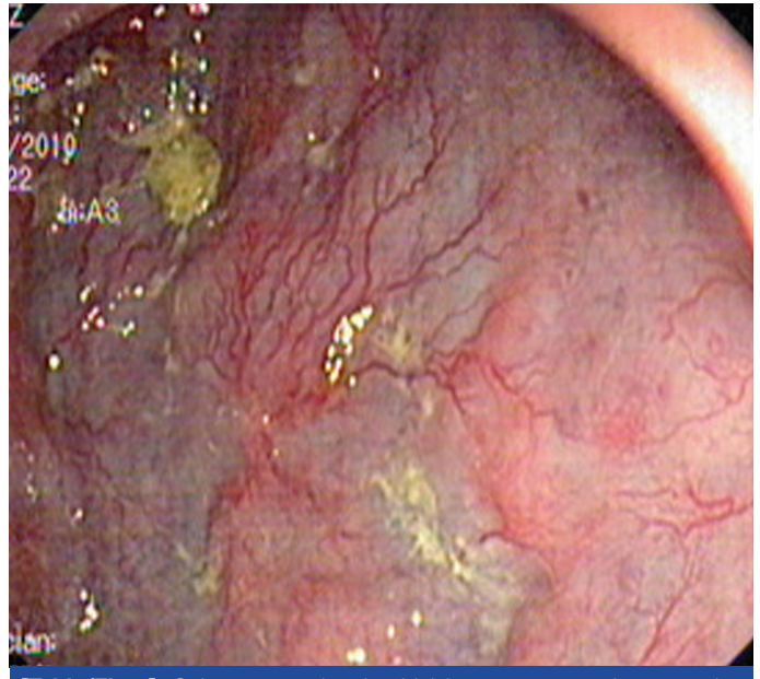
[Table/Fig-7]: Colonoscopy showing bluish tortuous vessels suggestive of rectal varices.

In one of the largest published series of KTS patients, haematochezia was reported in only six of 588 patients, although a few other cases may have gone unnoticed [5]. Management of colorectal intestinal hemangiomas in KTS will depend on the extent and severity of blood loss. When the entire rectum is severely involved, surgery is less attractive, as a permanent stoma will prove necessary.